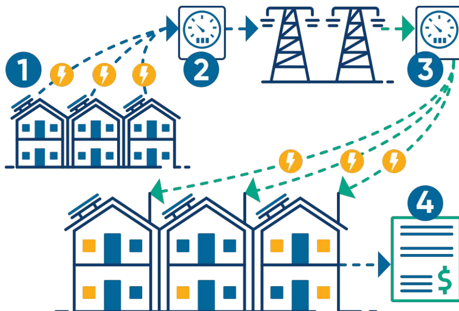
Multifamily Virtual Net Metering Graphic

Due to refusal by the electric utility to provide bill crediting services, and lack of state policy, virtual net metering was not available to this project.